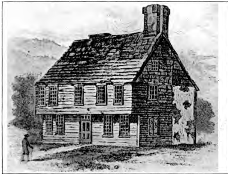
GOV. WILLIAM CODDINGTON HOUSE NEWPORT, R. I.